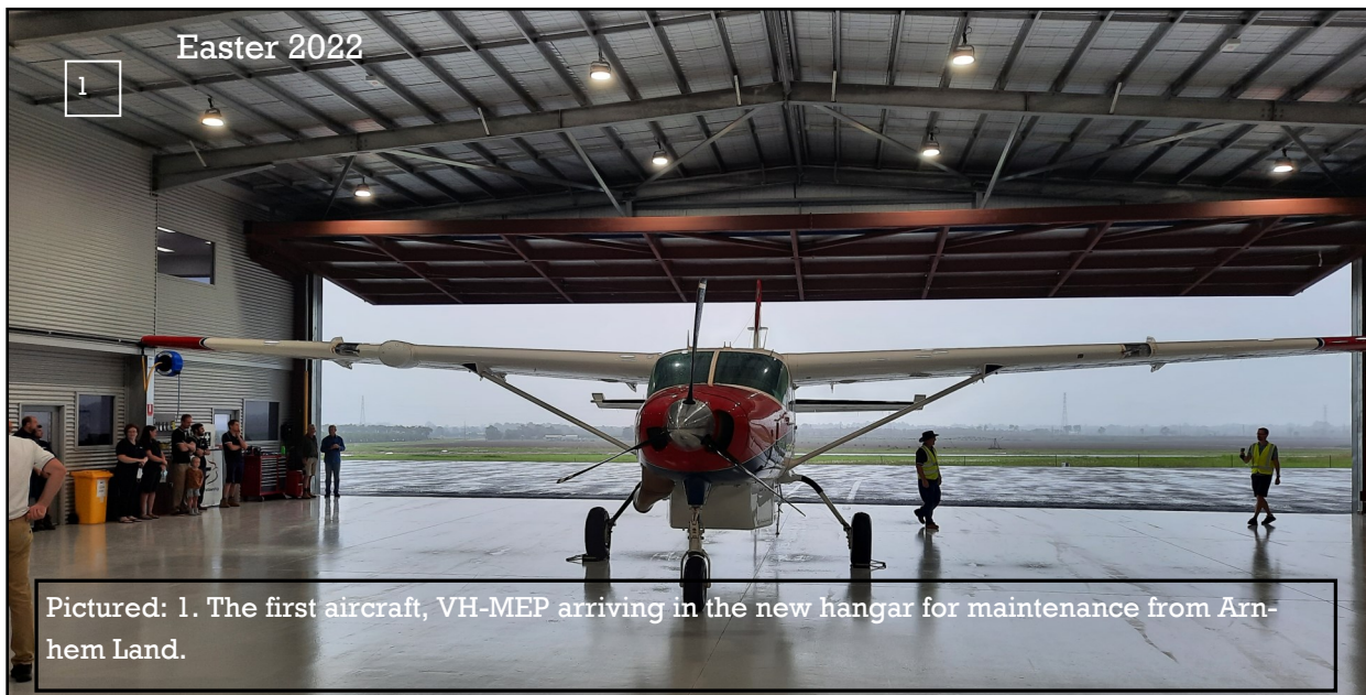
Pictured: 1. The first aircraft, VH-MEP arriving in the new hangar for maintenance from Arnhem Land.