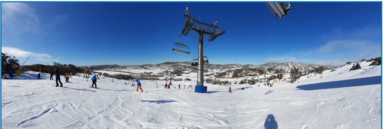
‘Front Valley’ at Perisher Ski Resort in Kosciuszko National park in NSW.